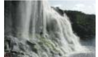
Sapo Falls, Canaima