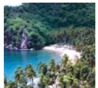
Playa Medina, Paria

See page 49 for another Venezuela itinerary