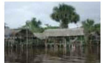
Warao houses in the Orinoco Delta

Days 12-15: Fly to Los Roques for 3 nights in the pretty blue-and-white painted Posada Caracol (see page 67), a perfect base from which to take boat trips to different cayes. Fly back to Caracas for onward connections.