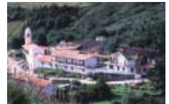
Hotel Los Frailes

Days 10-14: Return to Barinas for a flight to Porlamar, via Caracas. Spend 4 nights at Casa Chiara, an oasis of peace and tranquillity just north of the town Juan Griego (see page 67). Fly back to Caracas for onward connections.