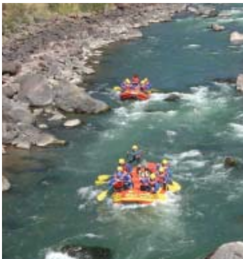
Rafting the Urubamba