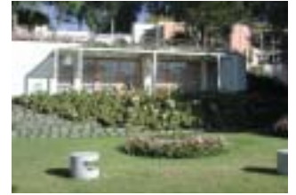
Posada del Puente

Days 12-16: Fly east to Puerto Maldonado for 4 nights in the Amazon, at the Tambopata Research centre and Posada Amazonas (see page 58). Fly to Lima for onward connections.