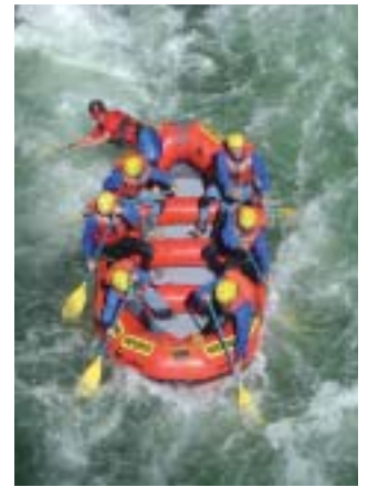
Rafting the Urubamba

Fixed departures. Amazonas offer several different itineraries, including family adventures.