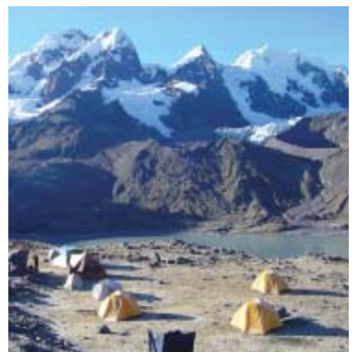
Trekking in Ausangate