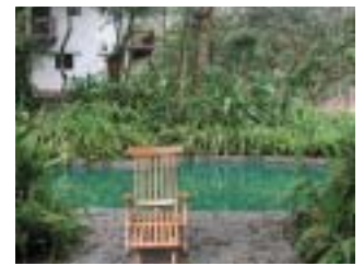
Machu Picchu Pueblo

Days 18-20: Fly to Quito for 2 nights at the Hostal de la Rábida, a small colonial hotel in the heart of the city, with a day to explore this beautiful colonial city before departure.