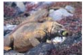
Land iguana, Galapagos