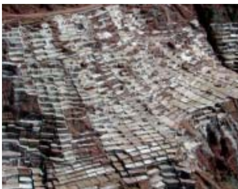
Maras salt pans