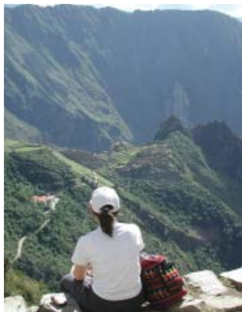
Machu Picchu from the Sun Gate