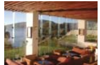
Libertador Isla Esteves, Puno