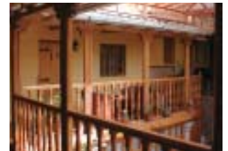
Hotel Los Apus, Cusco