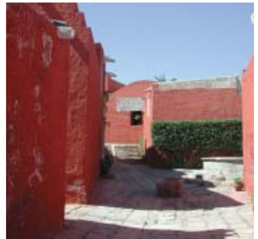
Santa Catalina convent