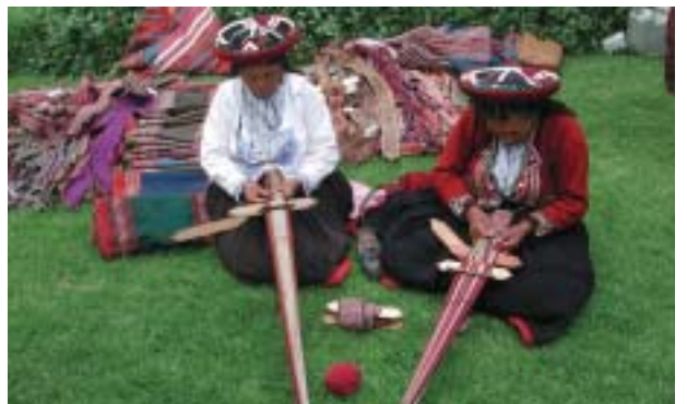
Weavers in the Sacred Valley