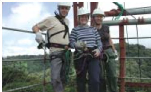
Preparing for the Skytrek

Canopy tours , sky walks and sky treks take you across the treetops on a combination of suspension bridges, zip lines and walkways for the best vantage point of the rainforest.