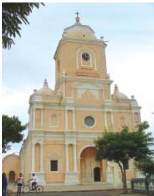
Nandaime church, Granada

The mountainous central region is covered with oak and pine forests, and coffee plantations. The Atlantic coast is prone to heavy rain and fearsome mosquitos. The population is mainly Indian, with a strong African influence (Moskitia was never colonised by the Spanish) and the major industries are gold mining, fishing and timber. The famous Corn Islands are renowned for their pristine white beaches and undisturbed coral reefs.