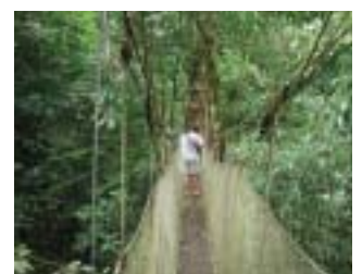
Rainmaker canopy walkway near Quepos