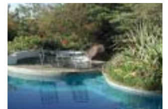
Finca Rosa Blanca

Days 10-15: Fly, via San José, to the lovely colonial town of Granada in Nicaragua for 2 nights at the Hotel Colonial, within walking distance of the city's many fine churches and museums. Full day excursion to the surrounding countryside and boat trip on Lake Nicaragua. Driven an hour south for 3 nights at the working farm and lodge of Morgan's Rock (see page 79), set between the virgin forest and untouched golden beaches of the Pacific coast. Continue by road to Managua for onward connections.