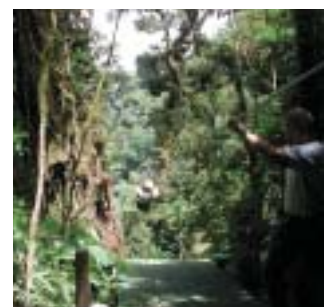
Skytrek in Monteverde